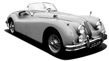
1956 Jaguar XK 140 MC OTS